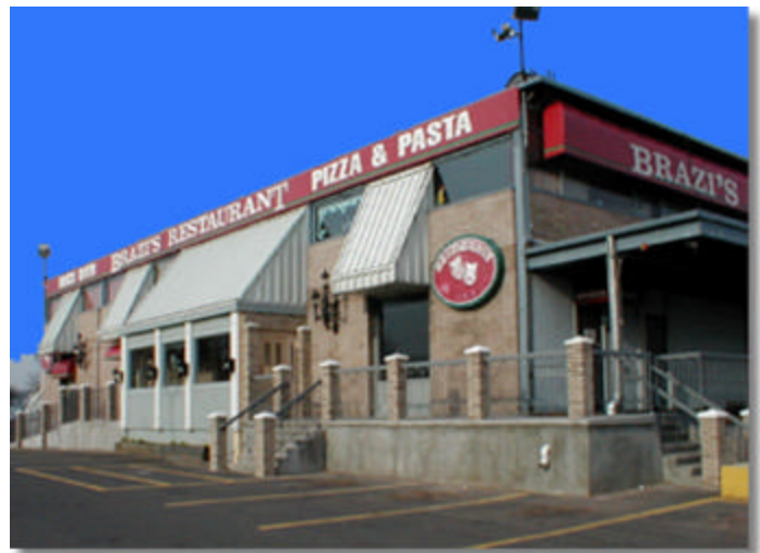
Brazi's Italian Restaurant